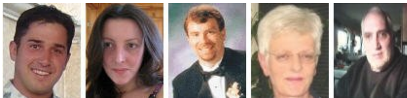
Affiliate Power Group